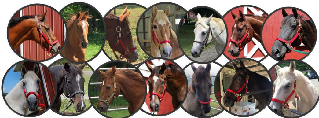
Top: Sonny, Ion, Emmy, Macyver, Junie, Lauro, Tilly; Bottom: Sam, Paisley, Duffy, Ben, Kody, Maverick, Nicky

Our beautiful horses were the best medicine for participants and volunteers alike in the stressful year. They taught us much about simple joys, partnership & trust.