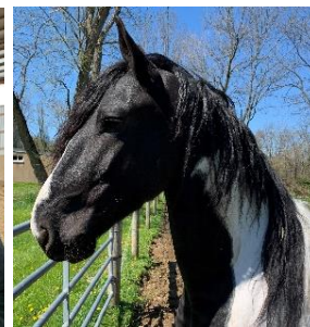
Harvey (Baroque Friesian)

We are so grateful for these and all the additional amazing horses at the farm who continued to bring us so much unconditional love, trust and learning opportunities.