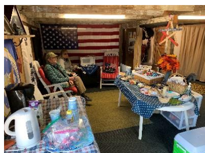
Lunch in our Veterans Zone