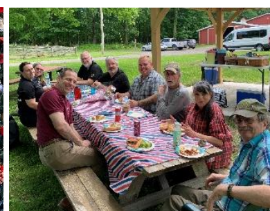
serving fabulous picnic lunches